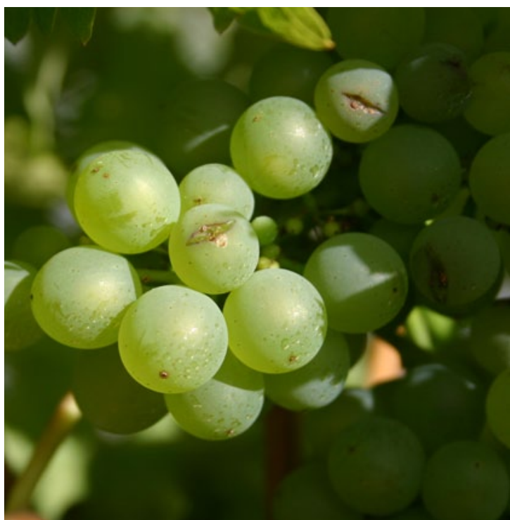
Figure 6. Berries with splits caused by heavy rain.

Bunch crowding promotes rapid bunch-to-bunch spread and may also lead to higher relative humidity in the bunch zone through the pooling or condensing of water in natural wells/pockets created by adjoining bunches.