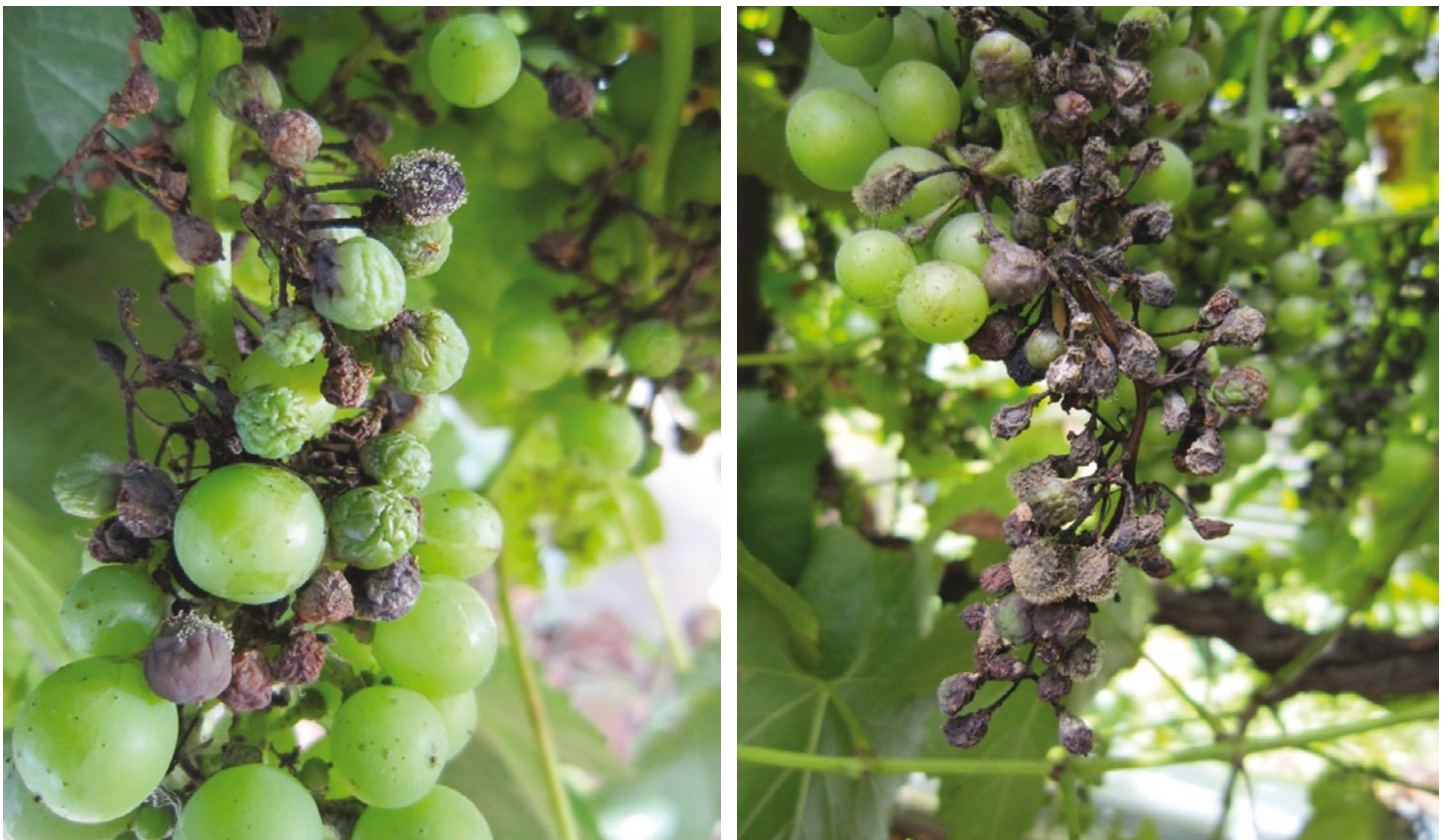
Figure 1. Botrytis on berries in Chardonnay bunches damaged by downy mildew

Most berry and bunch rots caused by botrytis develop in late summer and autumn (early- to mid-summer in warm/hot areas) as grape berries mature. The first signs of infection are small, round water-soaked spots that may be lighter in colour on red grapes. When berries are rubbed, the skin over these spots cracks and slips freely (slip skin), revealing the firm inner-berry pulp. Gradually infected berries soften and turn brown (or pink-brown in white grapes), but they may remain swollen as the rot spreads within them. Later, grey to buff coloured fungal tufts grow from splits in the skins of the infected berries. In compact bunches, the rot may spread rapidly from berry to berry until entire bunches are rotted and covered with matted grey velvet-like fungal growth (Figure 3). When dry conditions follow infection, the rotting berries dry up like raisins. While some fall from bunches others remain, especially in tight bunches.