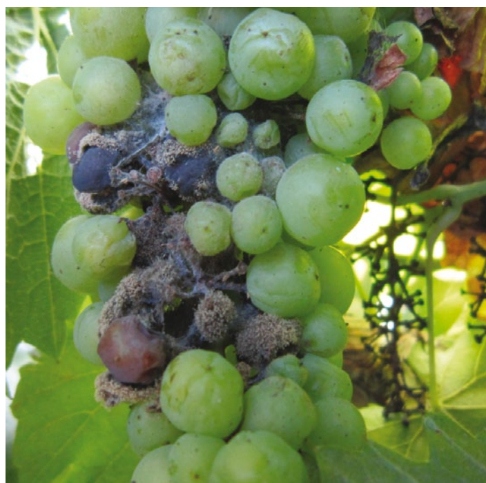
Figure 7. Botrytis bunch rot arising from Chardonnay berries and bunch tissues damaged by a light brown apple moth caterpillar.