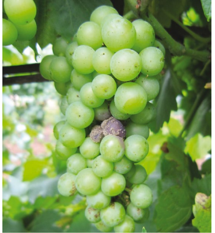
Figure 2. Botrytis green berry rot in Chardonnay bunches (Photos: RW Emmett, DPI Victoria).