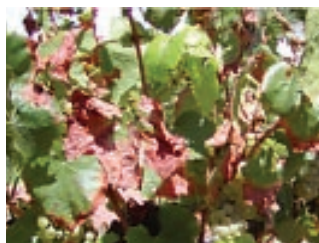
Chardonnay on own root

In Rob's Padthaway Chardonnay and Shiraz trials, the highest wine chloride concentrations were from vines on K 51-40 rootstock. Own-rooted vines accumulated more chloride than most grafted vines, with Shiraz gener-